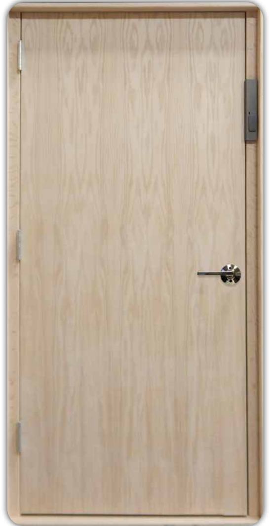
Flush Door Frame with EMDL and Latch Guard (Door by others)

Symmetry's Flush Mount Landing Door Frames enhance safety.