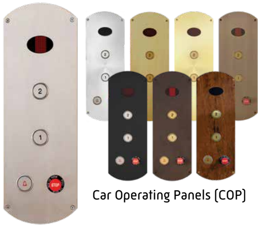
Car Operating Panels (COP)