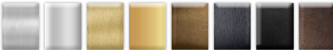
Brushed Stainless Steel