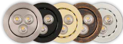
Recessed LED Lights with Trim