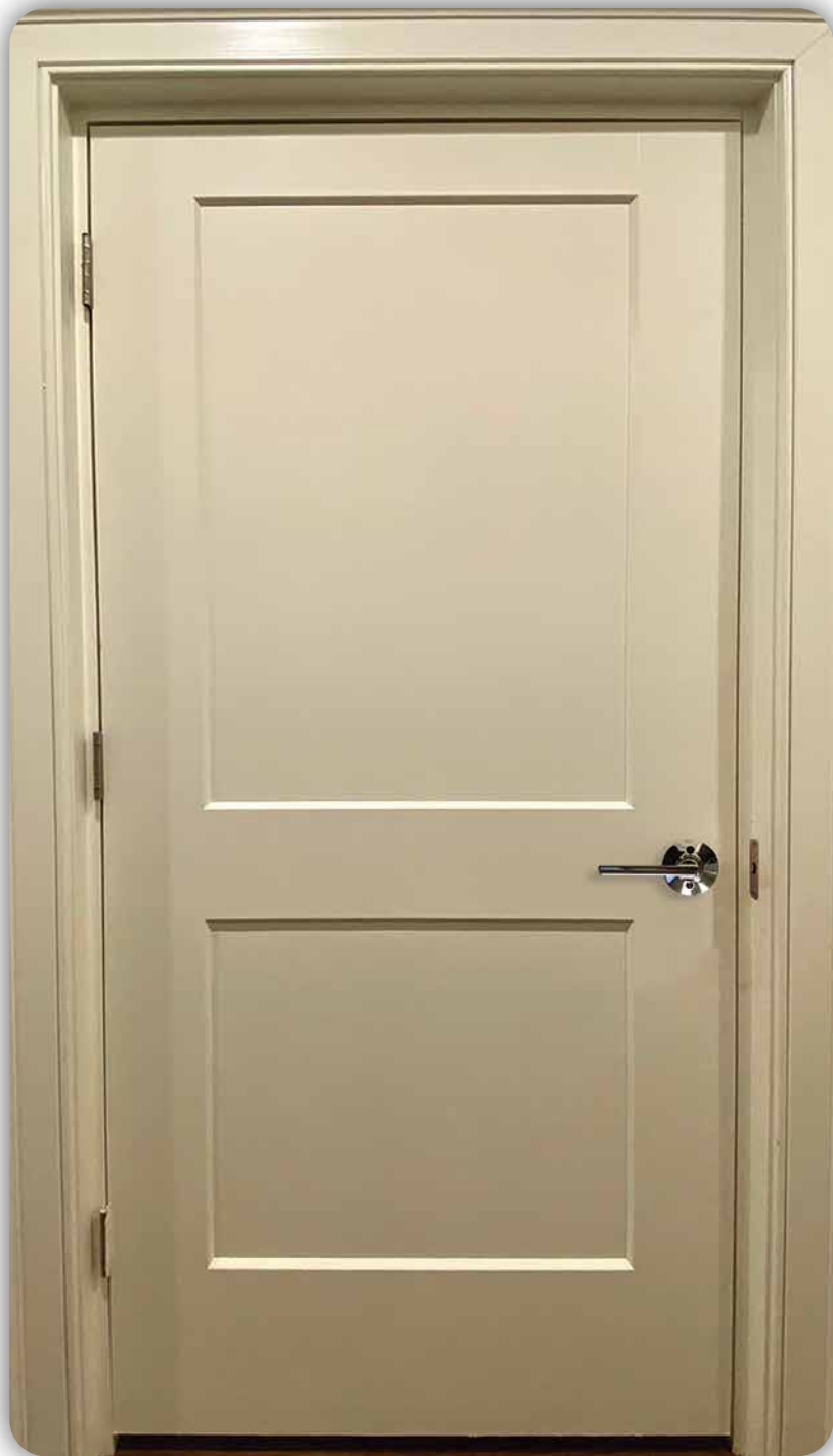
Flush Door Frame with Symmetry Locking Device (SLD) (Door by others)